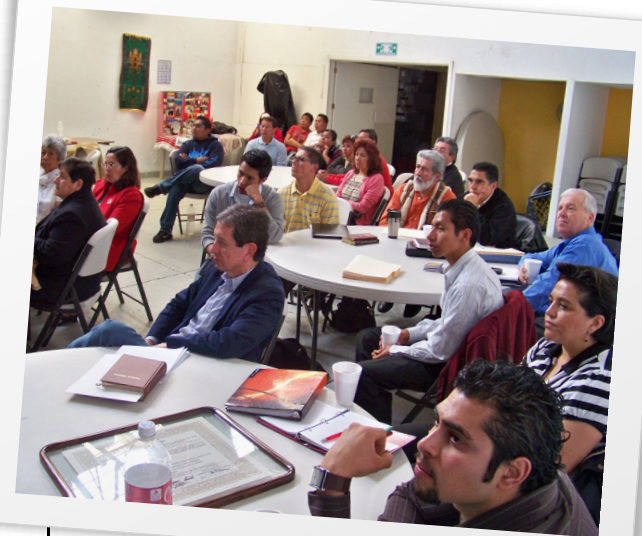
Jebala Conference in Mexico

planned strategy. It gives them hope that they, too, are engaged at a meaningful level in the Great Commission." ♦